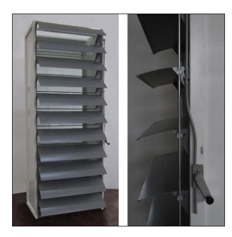
Fig. 1: Prototype of the double skin façade proposed in an open configuration

The mobile shading system remains horizontal (open) in winter time, to provide the building with the maximum possible solar radiation, which penetrate through the façade of the building, specifically due to lower height of sun at this time of the year. This system becomes more efficient as it is associated with multiple reflection of opaque surface of shading system